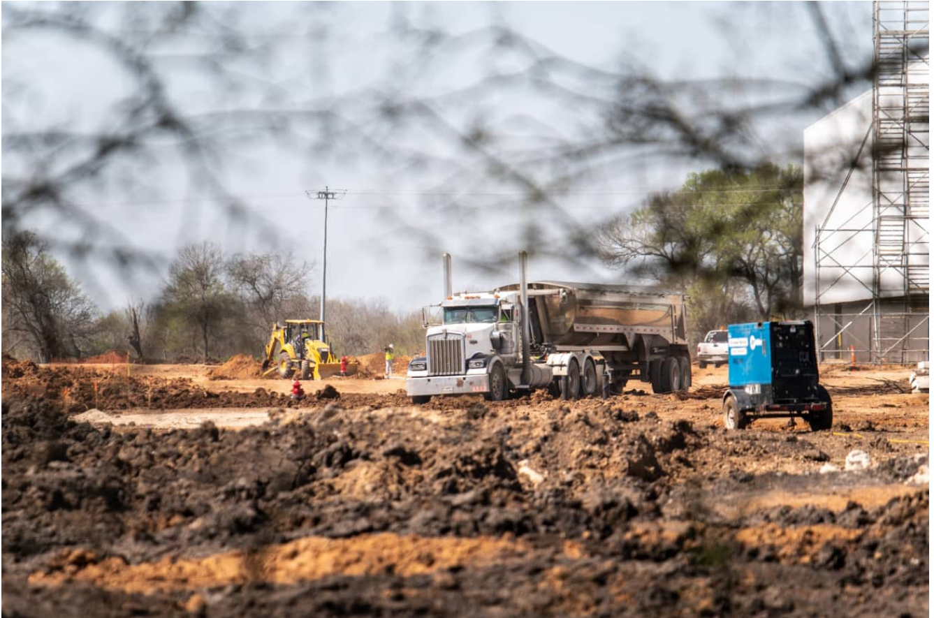
Construction at a SpaceX site in Bastrop County in February.