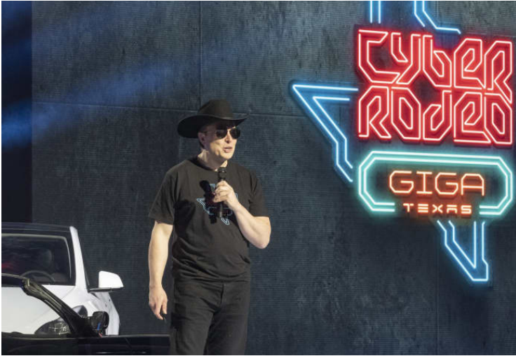
Elon Musk addressed guests at the grand opening of Tesla's Gigafactory Texas in April 2022.

Some local real-estate and land officials said they have been told by people close to Mr. Musk that the billionaire owns even more land in the area—as much as 6,000 acres.